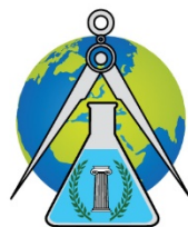
Exhibit & Presentation Guidelines (grades 6-12)

VALERO ENERGY FOUNDATION & TEXAS A&M UNIVERSITY-CORPUS CHRISTI COASTAL BEND REGIONAL SCIENCE FAIR FEBRUARY 14–16, 2019 • sciencefair.tamucc.edu