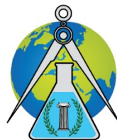
Exhibit & Presentation Guidelines (grades K-5)

VALERO ENERGY FOUNDATION & TEXAS A&M UNIVERSITY-CORPUS CHRISTI COASTAL BEND REGIONAL SCIENCE FAIR FEBRUARY 14-16, 2019 • sciencefair.tamucc.edu